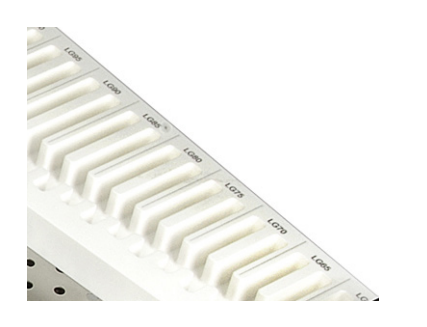
Stainless steel trays